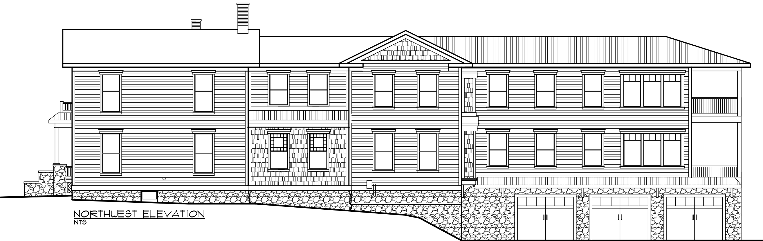
NORTHWEST ELEVATION NTS