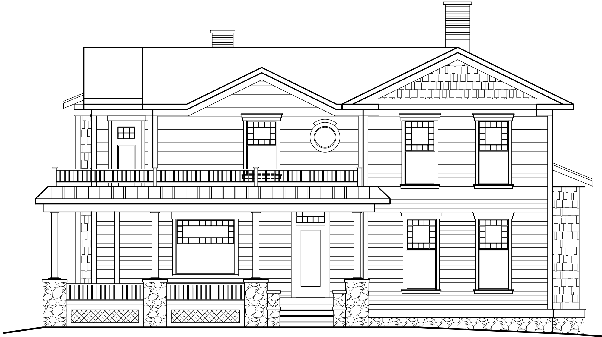
NORTHEAST ELEVATION NTS