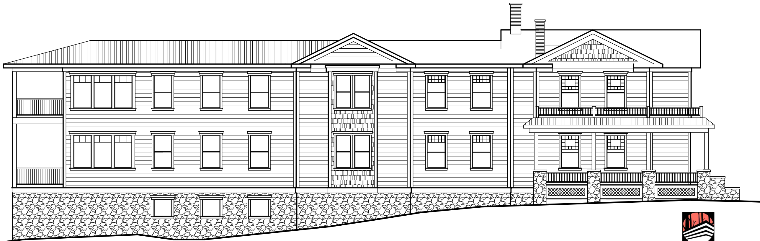
SOUTHEAST ELEVATION NTS