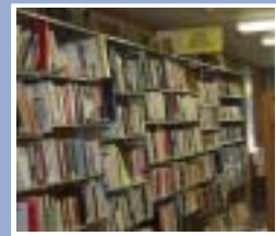
Friends of the Library Used Book Sale Area in the Cup and Chaucer Coffee Bar.

Mark your calendars now! For more information go to the library's website and click on the "FRIENDS OF THE LIBRARY" link.