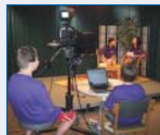
MCTV's Summer Video Camp 2009

Cable access television was formed to put the power of this medium in the hands of the people. In Midland, this has resulted in approximately 25,000 programs being submitted for cablecasting on, at first two and now, four channels (MCTV 3 & 15, MGTV 5 and MPS-TV 17 on Charter Communications cable).