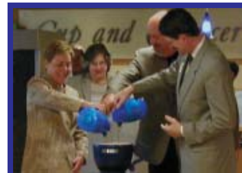
Grand Opening September 22, 2004

You are invited to celebrate the first anniversary of the Grand Opening of the Cup and Chaucer. Join us September 18-24 for: Daily anniversary specials ~ Chocolate kisses ~ Drawings for mugs ~ Coupons ~ and birthday cookies on September 22!