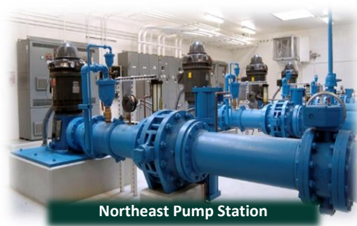
Northeast Pump Station

If present, elevated levels of lead can cause serious health problems, especially for pregnant women and young children. Lead in drinking water comes primarily from materials and components associated with service lines and home plumbing. The City of Midland is responsible for providing high quality drinking water but cannot control the variety of materials used in plumbing components. When your water has been sitting for several hours, you can minimize the potential for lead exposure by flushing your tap for 30 seconds to 2 minutes before using water for drinking or cooking. If you are concerned about lead in your water, you may wish to have your water tested. Information on lead in drinking water, testing methods, and steps you can take to minimize exposure is available from the EPA Safe Drinking Water Hotline at (800) 426-4791 .